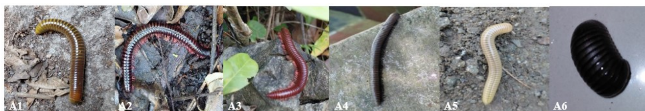
Figure 2. Millipede (Diplopoda) species. A1. Anadenobolus monilicornis , A2. Epibolus pulchripes , A3. Trigoniulus corallinus , A4. Pachyiulus varius , A5. Pachyiulus cattarensis , A6. Zephronia profuga .